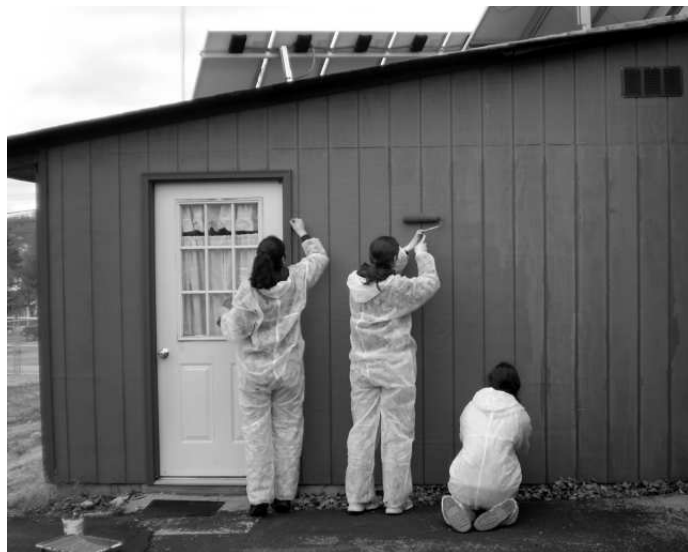
Notre Dame students painting ASPI's office building