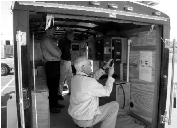
Workshop participants explore the finer points of ASPI's Solar Trailer