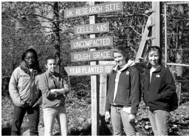
Notre Dame students learn about reforestation and reclamation at the Starfire mine site