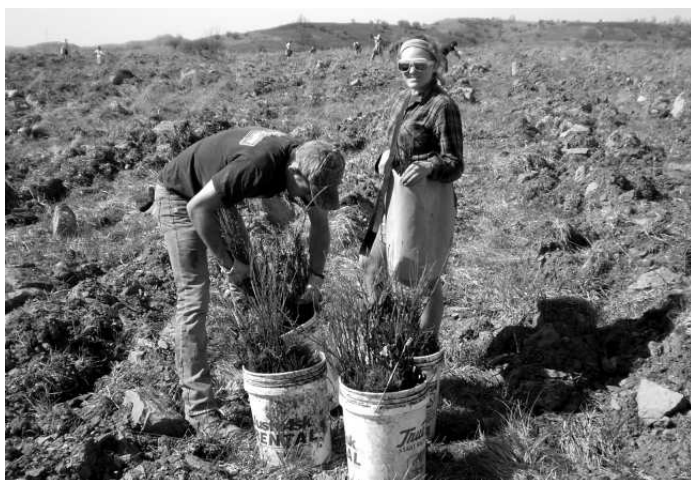
Eckerd College students plant native trees in eastern Kentucky

Our Eckerd group moved on to plant 23 eight-foot redbud trees around the town of Livingston, as a part of the Tour Southeast Kentucky's "Redbud Month" initiative to beautify our byways.