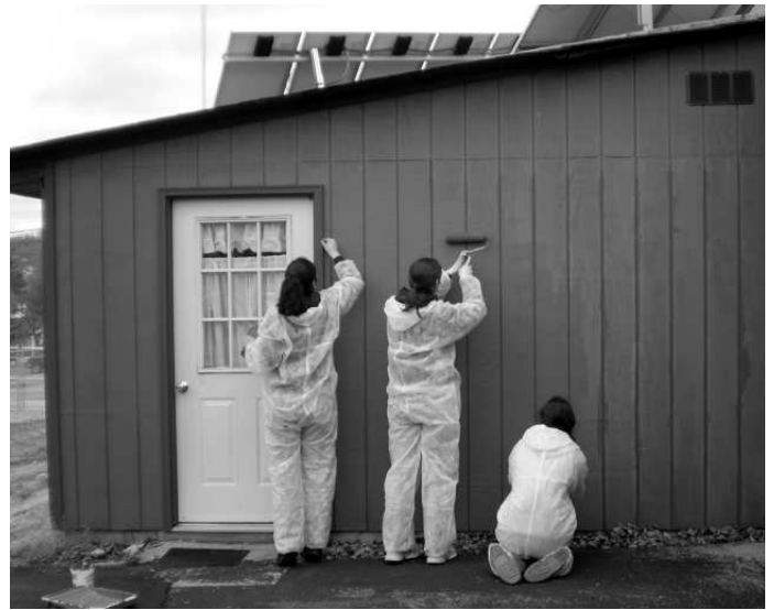
Notre Dame students painting ASPI's office building