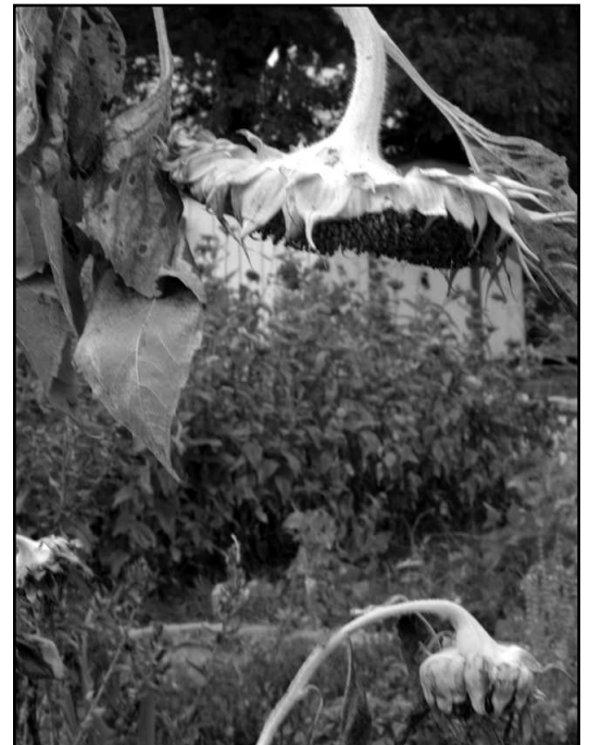
Dried seed heads in our pollinator and wild bird garden in Mt Vernon